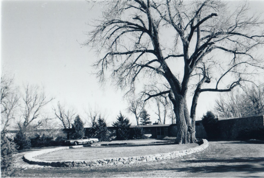
Museum Grounds, 1969. In this photo, you can see the early circular driveway and the giant cottonwood tree that was taken down in the early 2000s due to safety issues. The main entrance was just behind and to the left of the tree. This is now the entrance for school groups.

In 2019, we're celebrating the 50 th anniversary of the Littleton Museum. Starting with the transfer of artifacts from the Littleton Historical Society to the (then) Littleton Historical Museum, museum staff and volunteers began the task of occupying the original building and creating the first exhibits. The house, which originally belonged to D.K. Lord and later the Vernon Ketring family, was retrofitted to accommodate exhibits, mainly about Littleton's agricultural past.